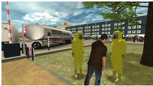
Figure 1 RescueSim using 3D as away to immerse the player

management (as in Innov8), there is practically nothing constructive in wandering back and forth through the 3D world.