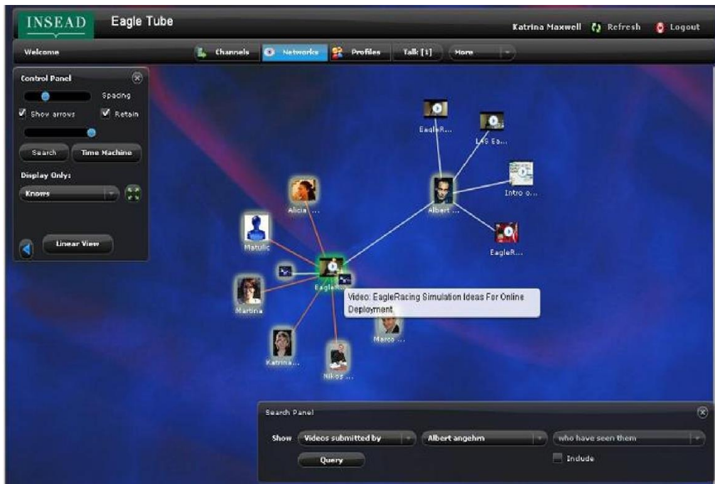
Figure 3 EagleRacing also shows that Serious Games can take many forms

they address soft skills such as collaboration, change management and crisis management that can be applied into every business and management sector.