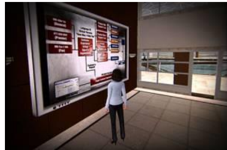
Figure 2 As Innov8 does not focus on exploring the office, this 3D feature only distracts the player

Metaphorical games can provide a high level of contextualization. An example of such game can be Elude, which aims to raise empathy and awareness of specific conditions related to others (depression) without flooding the player with large quantities of information to which (s)he has no relation with.