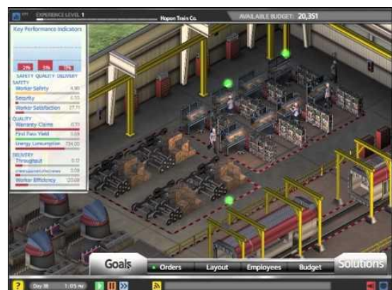
Figure 2 Task & Visual overload in PlantVille